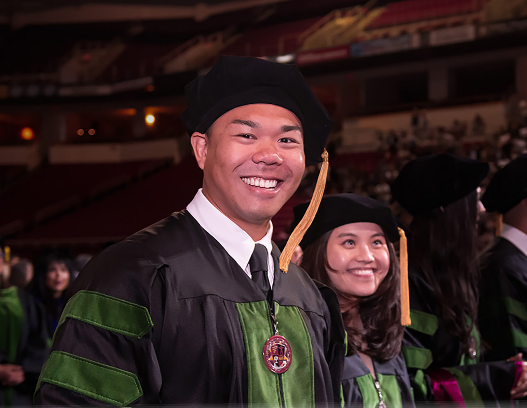
Above: CHSU-COM graduates at Commencement and Hooding Ceremony.