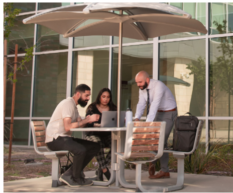
Above: Student Doctors studying and socializing on campus.