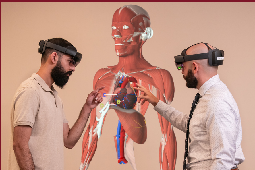
Above: Augmented Reality HoloAnatomy Simulation.