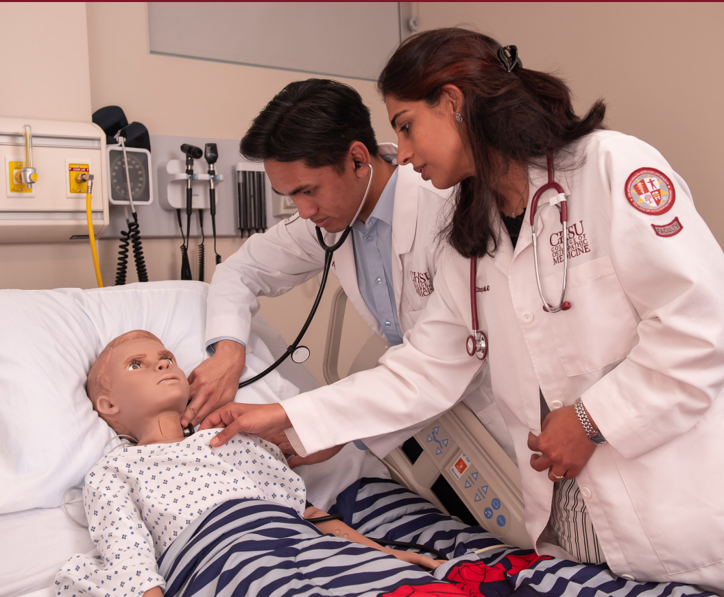
Above: Student providing care to one of our high-fidelity patient manikins.

The Simulation Center is at the forefront of medical and interprofessional education in the Central Valley. Our innovative Simulation Center features an in-patient hospital wing with an emergency room, operating room, scrub room, and 3 patient rooms; an outpatient wing with 12 exam rooms; and 2 labs for HoloAnatomy and task trainers.