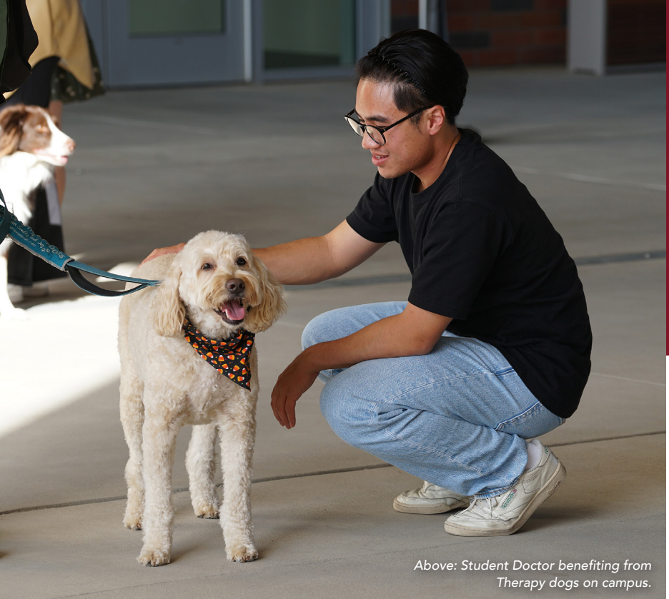
Above: Student Doctor benefiting from Therapy dogs on campus.

We strive to cultivate respect, inclusion, excellence, and service. Creating a trusting and caring culture is at the heart of the Office of Student Affairs' mission and staff.