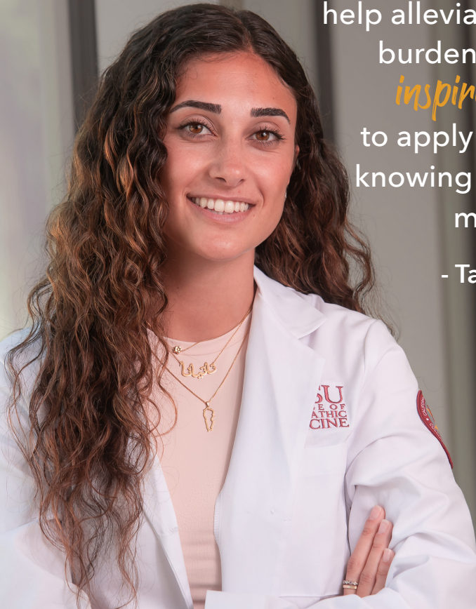
Above: Student Doctor speaks on scholarships.