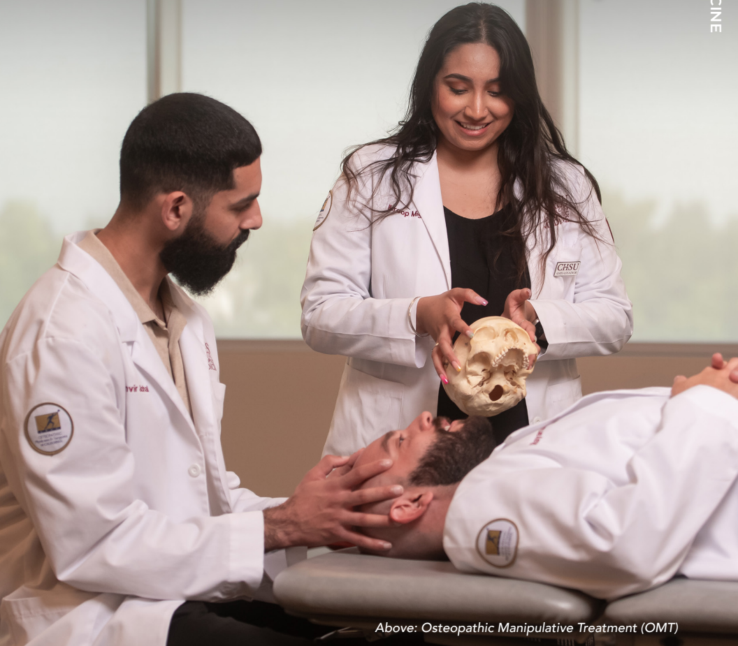
Above: Osteopathic Manipulative Treatment (OMT)